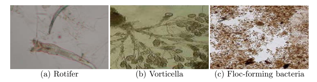
Fig. 2. Typical biological forms observed by microscopy in the O unit of the A/O ${\rm process}$

suggested that the environment of the O unit was good and helpful for forming the protozoan ( Vorticella ) and micro-metazoa ( Rotifers ).